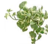
Pothos pearl & jade

For more varieties of plants, ask for full brochure!