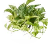
Pothos marble queen